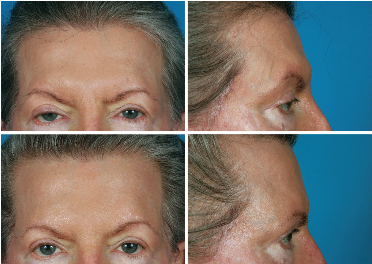
Fig. 3. Preoperative and 2-year postoperative frontal and lateral photographs of the forehead after endoscopic frontal bossing correction.

temporal fascia, exposing the deep temporal fascia. The midline and the intermediate (7 cm from the midline) incisions were carried down to periosteum. Endoscopic access devices (Applied Medical Technology, Inc., Brecksville, Ohio) were then inserted through all the incisions. The dissected plane was subperiosteal in the central forehead area and superficial to the deep temporalis fascia in the temple region. Lateral incisions and dissection superficial to the deep temporal fascia was completed for the patients undergoing forehead rejuvenation. A 30-degree 4-mm scope (Karl Storz, Inc., Tuttlingen, Germany) was introduced through the endoscopic access device. The dissection was continued toward the supraorbital rim using the endoscope. As the dissection was advanced medially, the supraorbital nerve, supraorbital vessels, and supratrochlear nerve were identified and protected. A sterling oval burr and shaver (ConMed Linvatec, Utica, N.Y.) with the attached irrigation device were used to contour the frontal bossing. Contouring of the frontal bone was assessed by a combination of visual in-