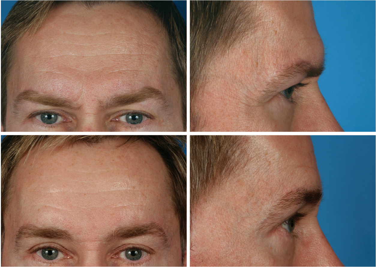
Fig. 5. Preoperative and 4-year postoperative frontal and lateral photographs of the forehead after endoscopic frontal bossing correction.