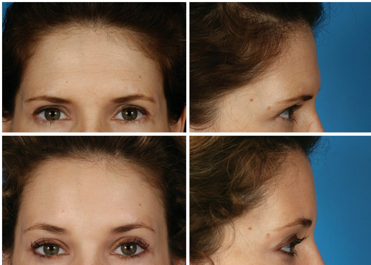
Fig. 4. Preoperative and 1-year postoperative frontal and lateral photographs of the forehead after endoscopic frontal bossing correction.