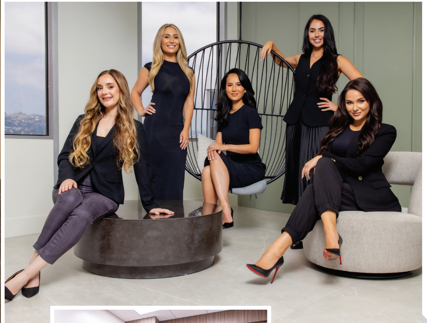
PHOTOGRAPHY BY PERK PLASTIC SURGERY